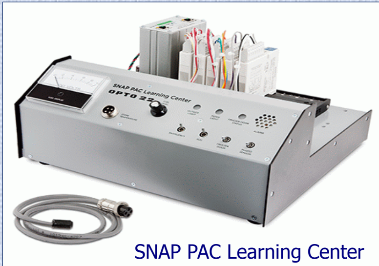
SNAP PAC Learning Center